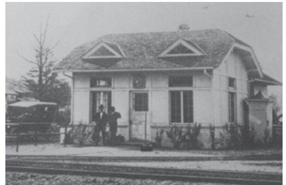
(Top) A passenger poses with staff of DUR and a Sylvan Lake to Pontiac interurban car, circa 1900.