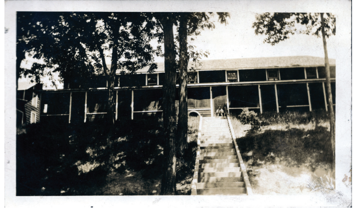
Oak Hill Beach Club building viewed from the dock, circa 1930s.