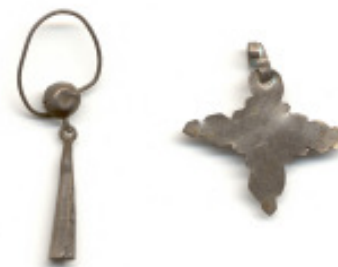
Artifacts found on Apple Island during the first archeological dig during the summer of 2000

Sponsors of the Apple Island Tours offered annually during the 3 rd Weekend in May