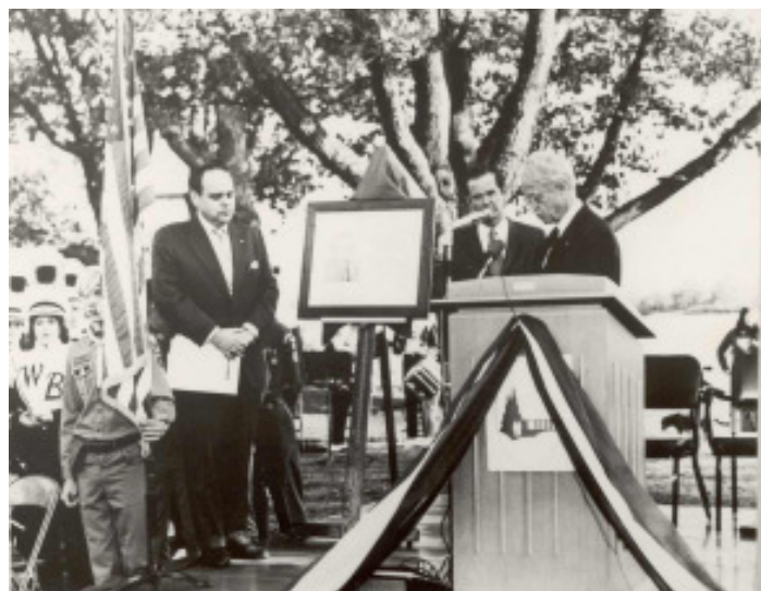
General Frederick S. Strong and Michigan Governor William Millikin during the ceremony presenting Apple Island to the West Bloomfield School District (1970).

The Sanctuary (and its characteristic resources of soil groups, shore edges, oak forest stands, bogs and topography) is unique in that it contains examples of every type of ecological system identified within the southeastern Michigan region. It is home to more than 400 species of trees and plants, including many rare in Oakland County. A detailed account of the island's flora can be found in Apple Island: The Marjorie Ward Strong Woodland Sanctuary , which is available from the Greater West Bloomfield Historical Society.