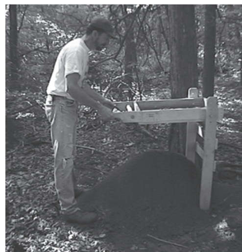
Summer of 2000 archeological dig

One sign of early European influence on this area's native population is the appearance of silver trade items, several of which were recovered during archaeological excavations on the island in June 2000. Jointly organized by the Greater