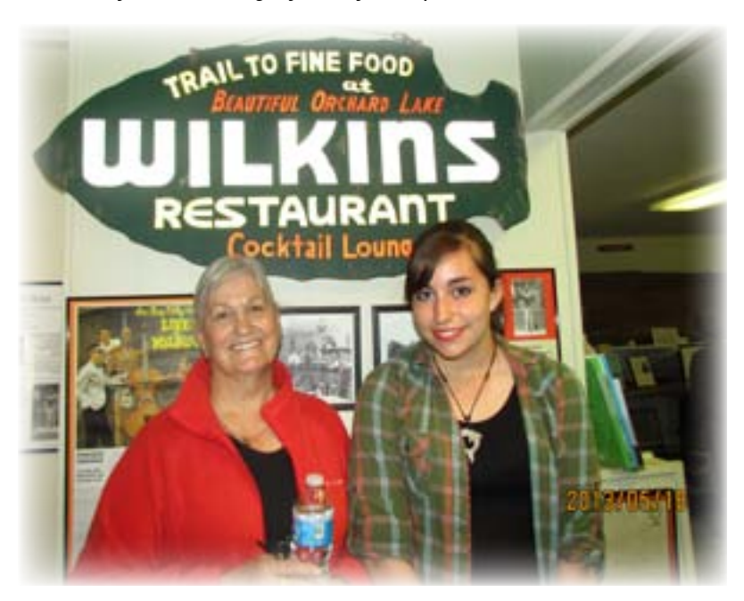
Wilkins relatives visit the Orchard Lake Museum exhibit about their family during the Apple Island Tours.