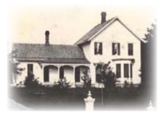
Emmendorf House pre-1900