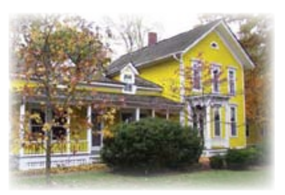
Emmendorf House circa 2011

Save the date! For the first time in 28 years, GWBHS will host a Historic Homes Tour! Living with History: Historic Homes Tour of Greater West Bloomfield will take place Saturday, June 21, 2014, from 10 am – 4 pm. Watch for more details to come about this self-guided tour of historic homes in greater West Bloomfield.